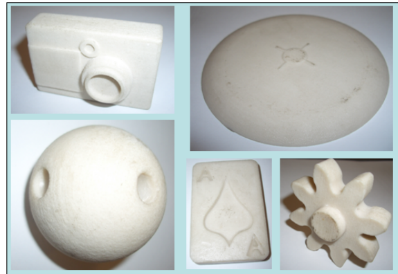
Fig. 3. Finished Prototypes

machines the students use are Z-Corporation 3 Dimensional printers. Previously instructed on the rapid prototyping machine, students load print their models on the 3 D printer. They were assisted by the instructor and the machine engineer when needed during this process. Students were asked to remove their prototypes and clean up their area once the printings are completed. Finished prototypes can be seen in Fig. 3.